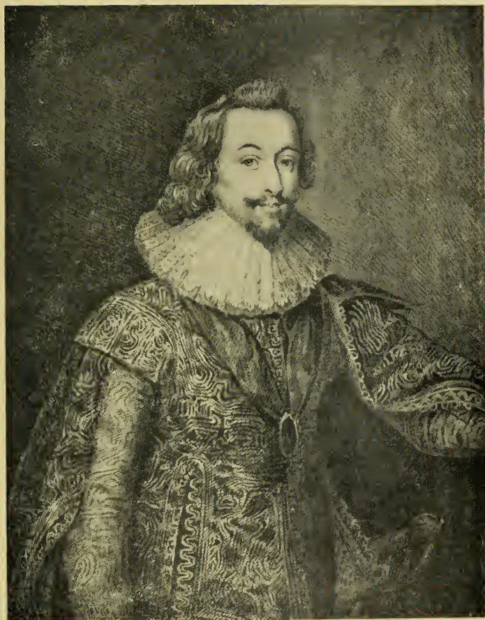
GEORGE VILLIERS, DUKE OF BUCKINGHAM